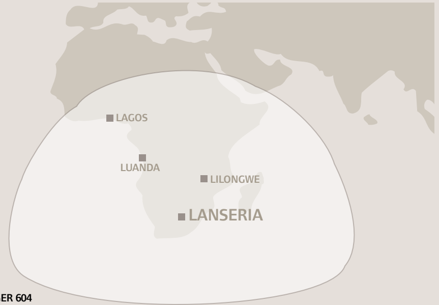
CHALLENGER 604 RANGE OUT OF LANSERIA