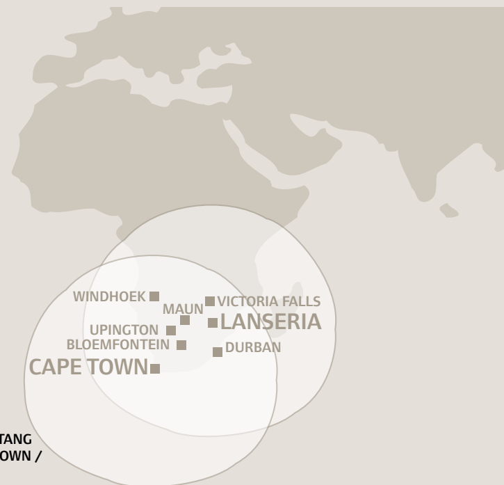
CESSNA CITATION MUSTANG RANGE OUT OF CAPE TOWN / LANSERIA

*based on average winds from doors shut to doors open