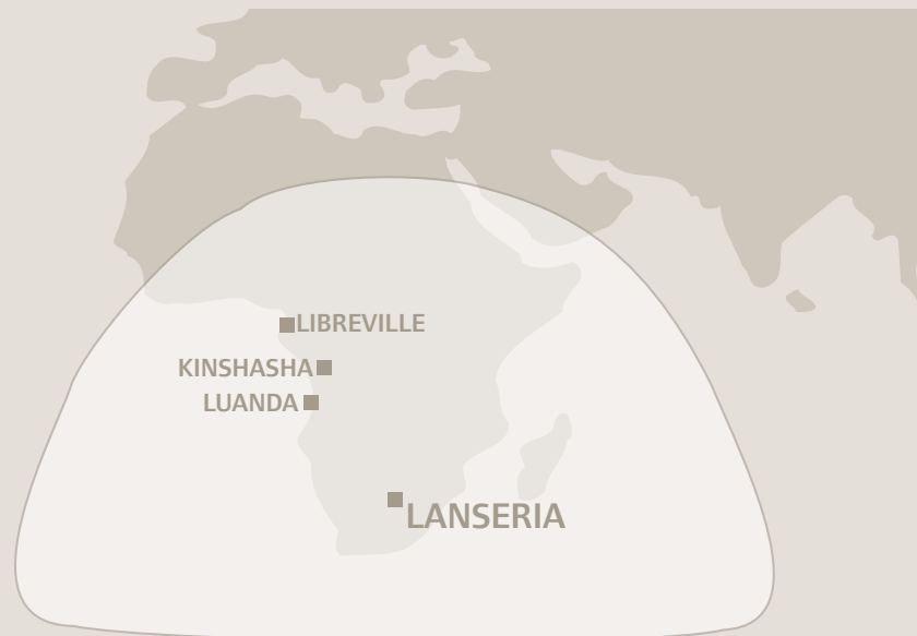
GULFSTREAM III RANGE OUT OF LANSERIA

*based on average winds from doors shut to doors open