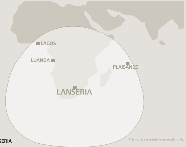
HAWKER 800XP RANGE OUT OF LANSERIA

This map is a schematic representation only.